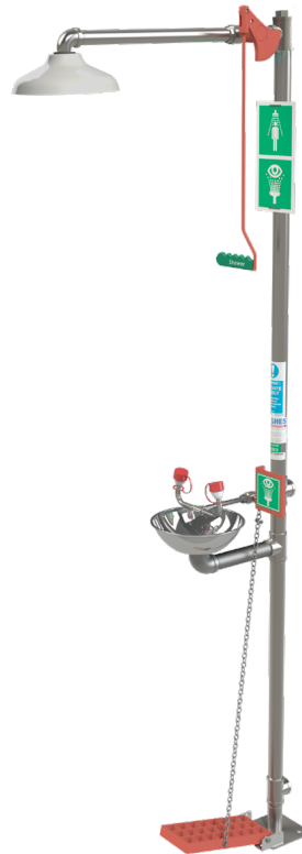
Shown with optional eye/face wash bowl (Part No.H-DA001), Foot treadle (Part no. H-DA003) and ABS shroud cover over spray nozzle (Part no. H-DA004)