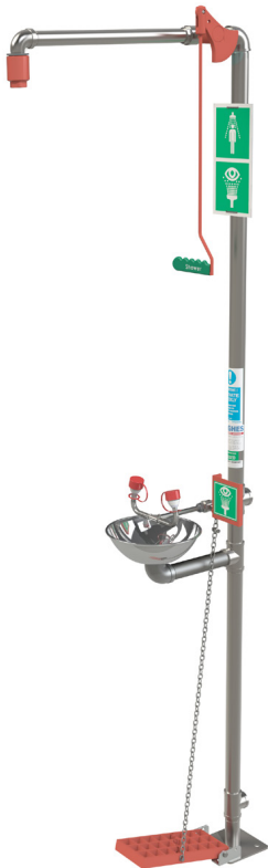
Shown with optional eye/face wash bowl (Part No.H-DA001) and Foot treadle (Part no. H-DA003)